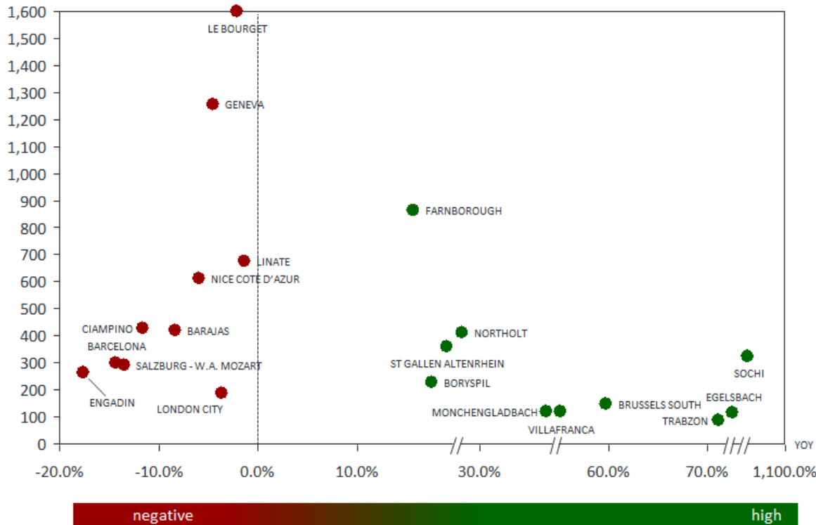
Departures February 2014

Note: Only Charter and Private flights are considered